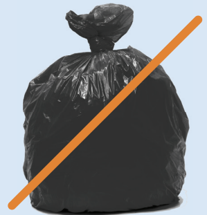
Plastic bags and plastic film