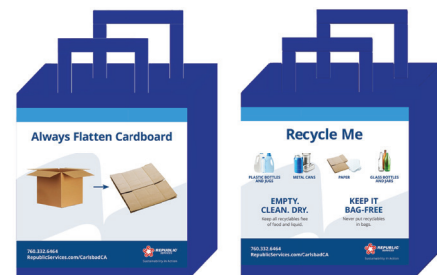
Move-In Kit and Magnet

Republic Services provides free kitchen caddies for residents to place their food scraps prior to placement in the organics cart. Contact Republic Services at 760.332.6464 or carlsbadservice@RepublicServices.com to request your free kitchen caddy.