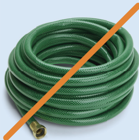
Garden hoses, holiday lights and extension cords