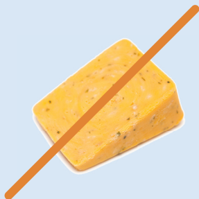
Food and liquids